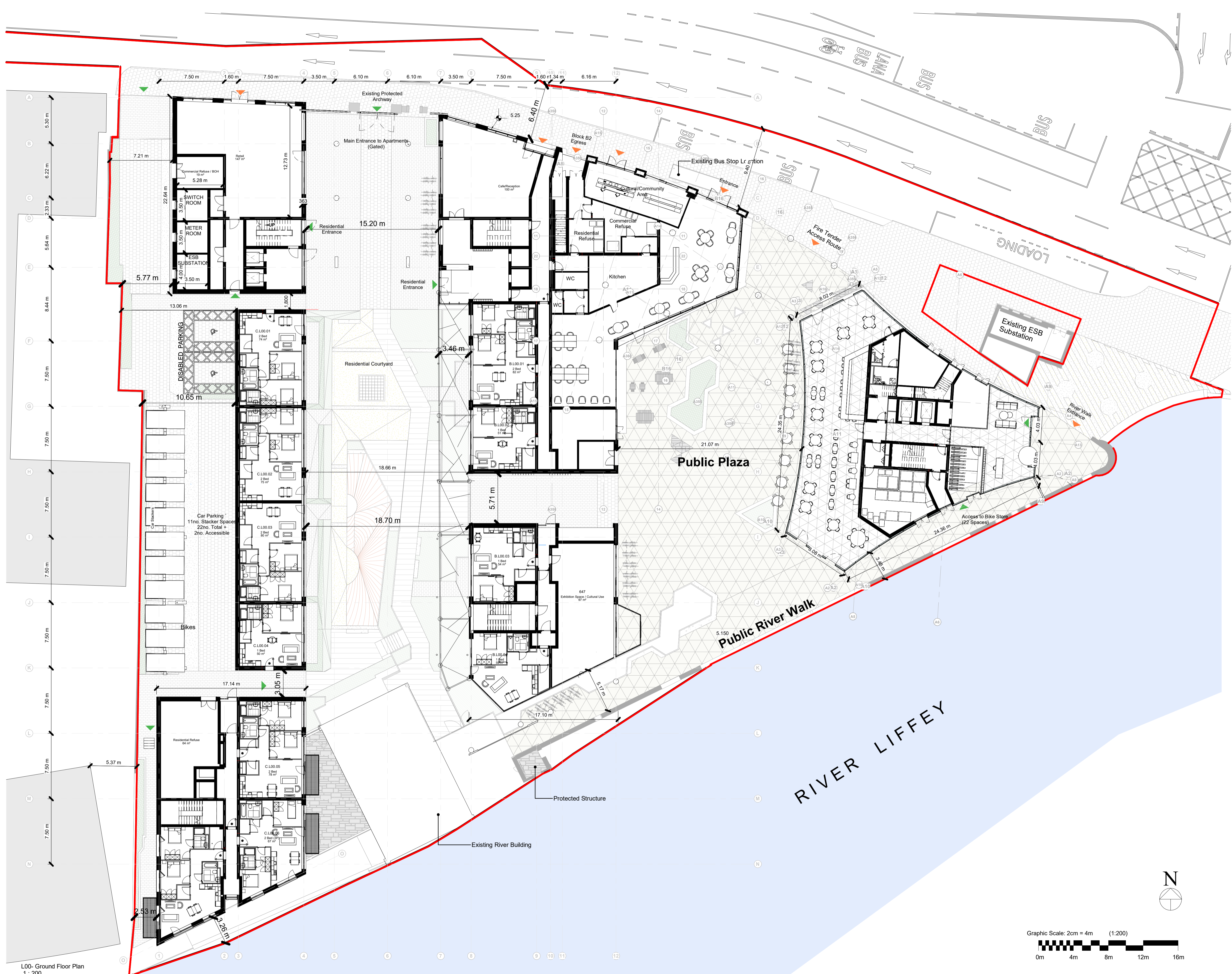
L00 - Ground Floor Plan 1: 200

Notes: - Do not scale from this drawing. Use figured dimensions in all cases. - Verify dimensions on site and report any discrepancies to the Architect immediately. - This drawing is to be read in conjunction with the Architect's Specification. - © This drawing is copyright and may only be reproduced with the Architect's permission.