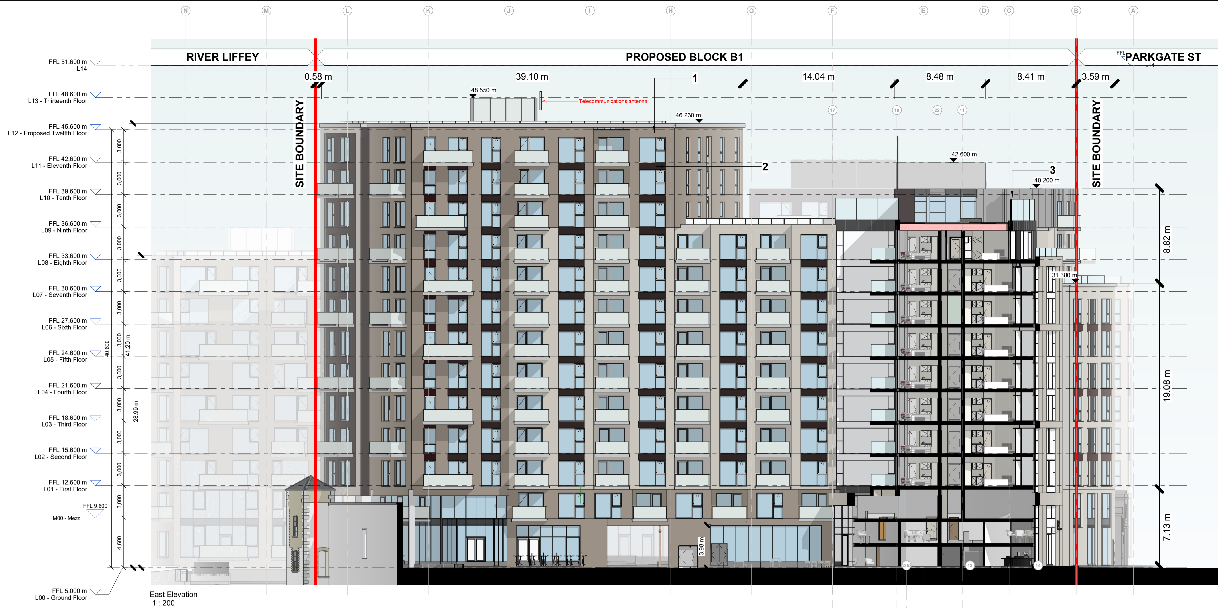
East Elevation 1 : 200