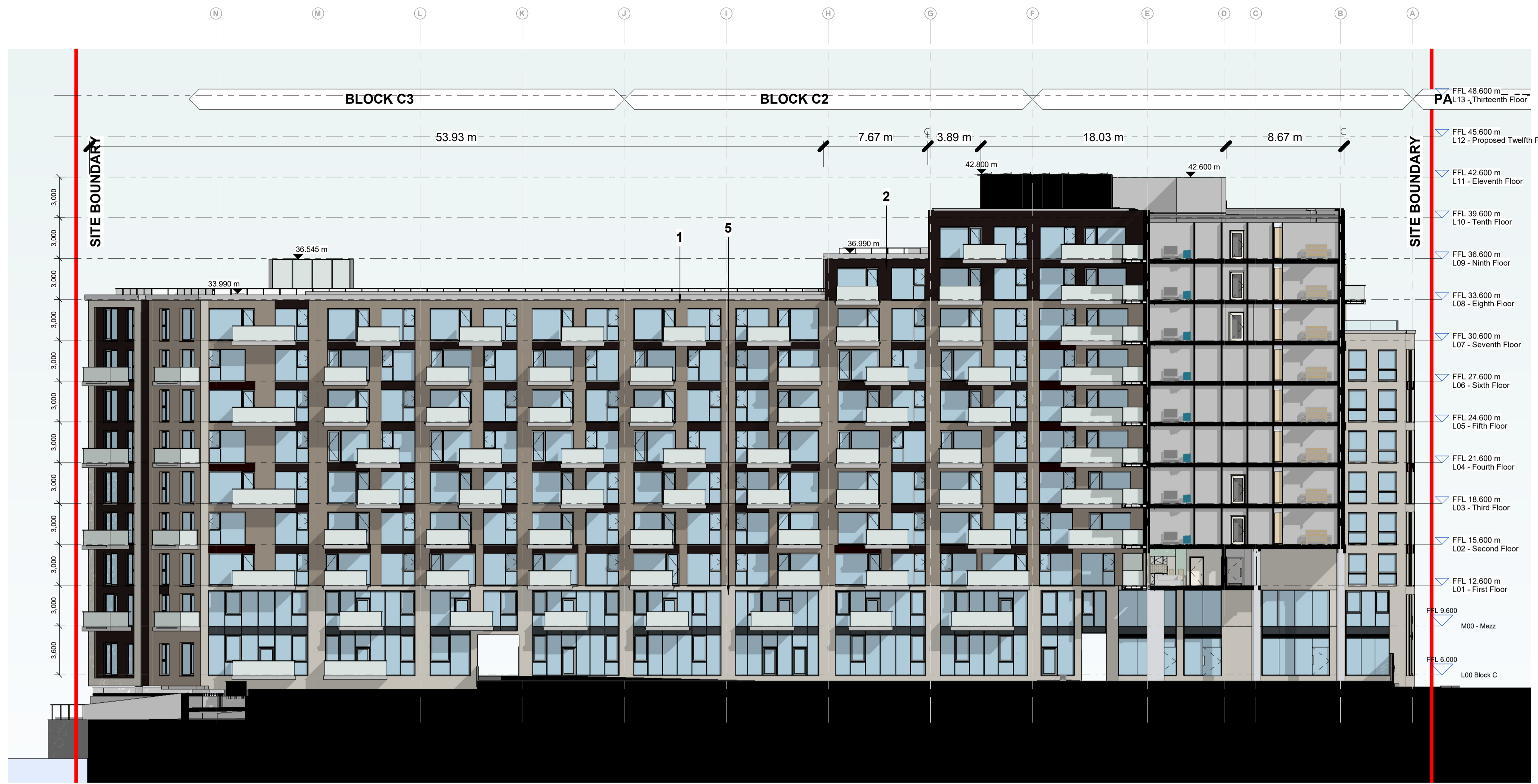
East Courtyard Elevation 1 : 200