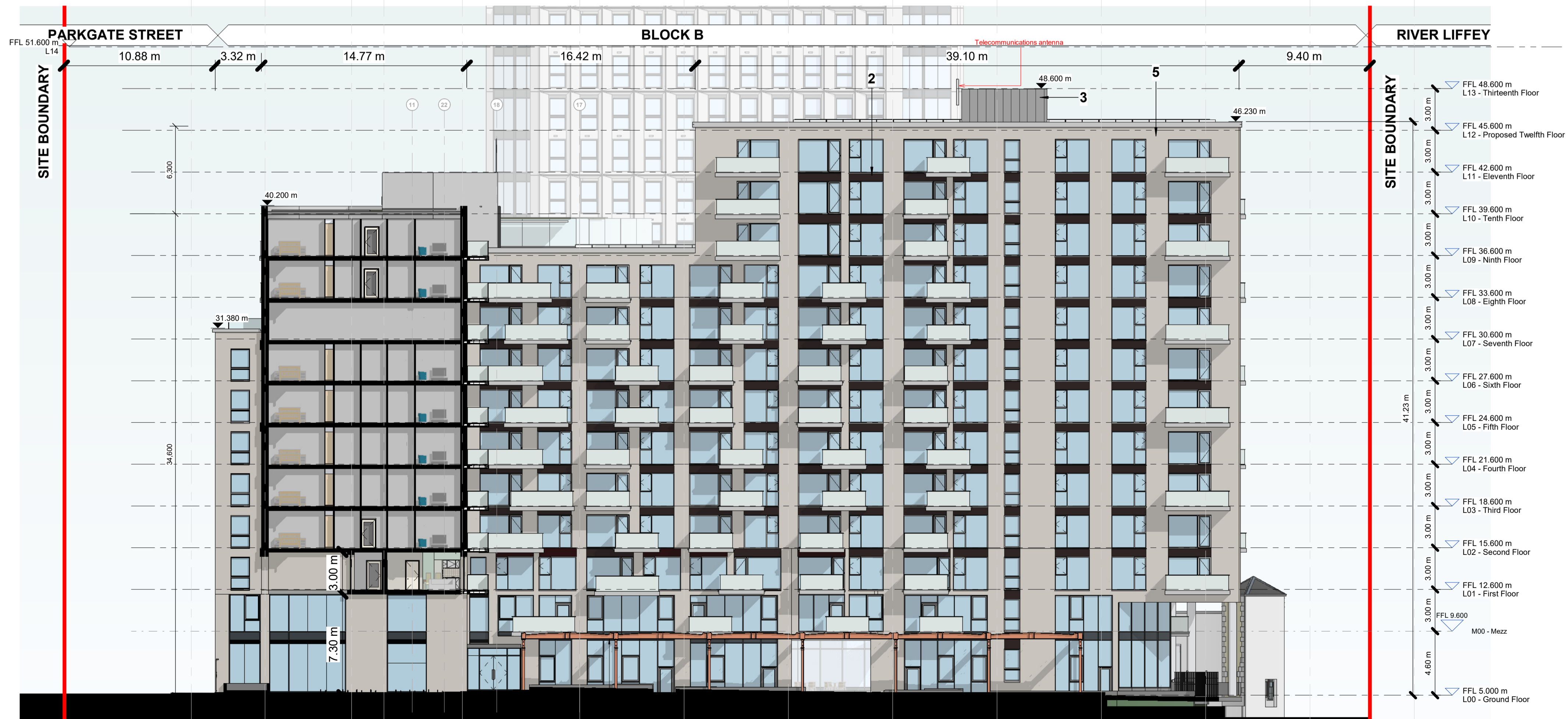
West Courtyard Elevation 1 : 200

Notes: - Do not scale from this drawing. Use figured dimensions in all cases. - Verify dimensions on site and report any discrepancies to the Architect immediately. - This drawing is to be read in conjunction with the Architect's Specification. - © This drawing is copyright and may only be reproduced with the Architect's permission.